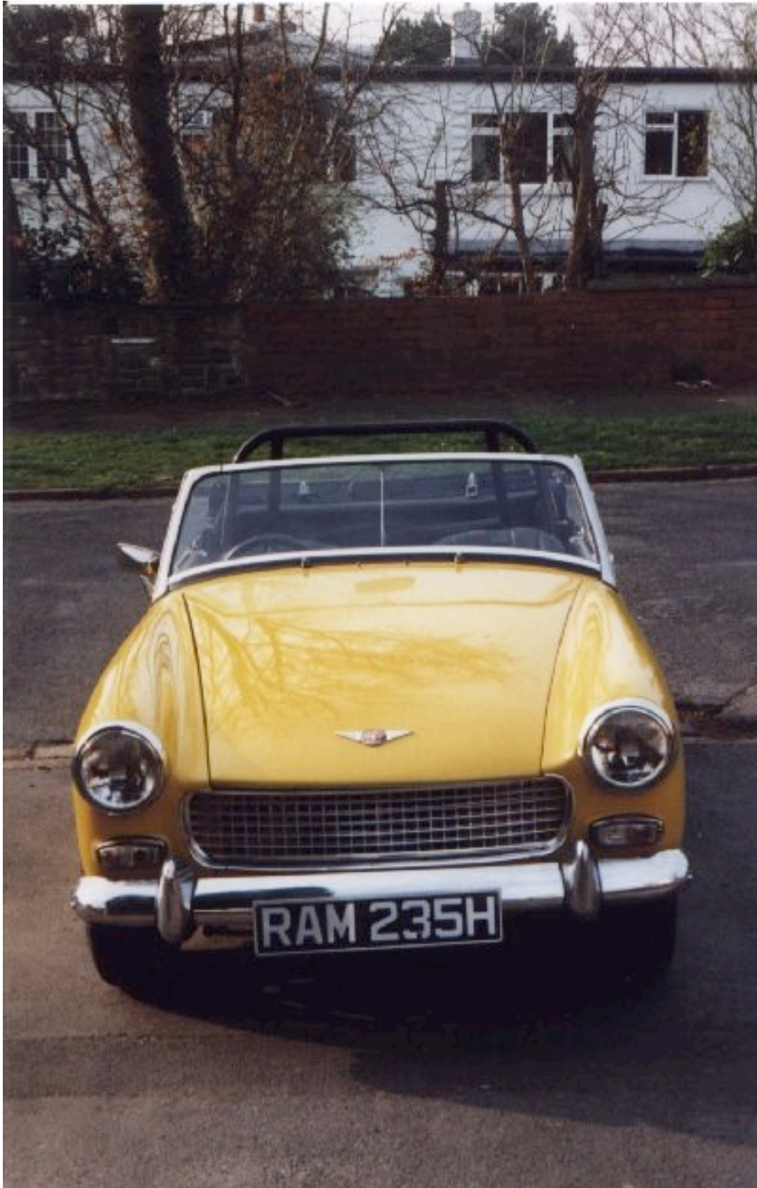
Words & Images (c) Neil Raven 1998/99 Updated 19th March 1999